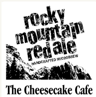
The Cheesecake Cafe

We serve only local, handcrafted draft beer, including our own Rocky Mountain Red Ale which is brewed for us by Alberta's own Alley Kat Brewery.